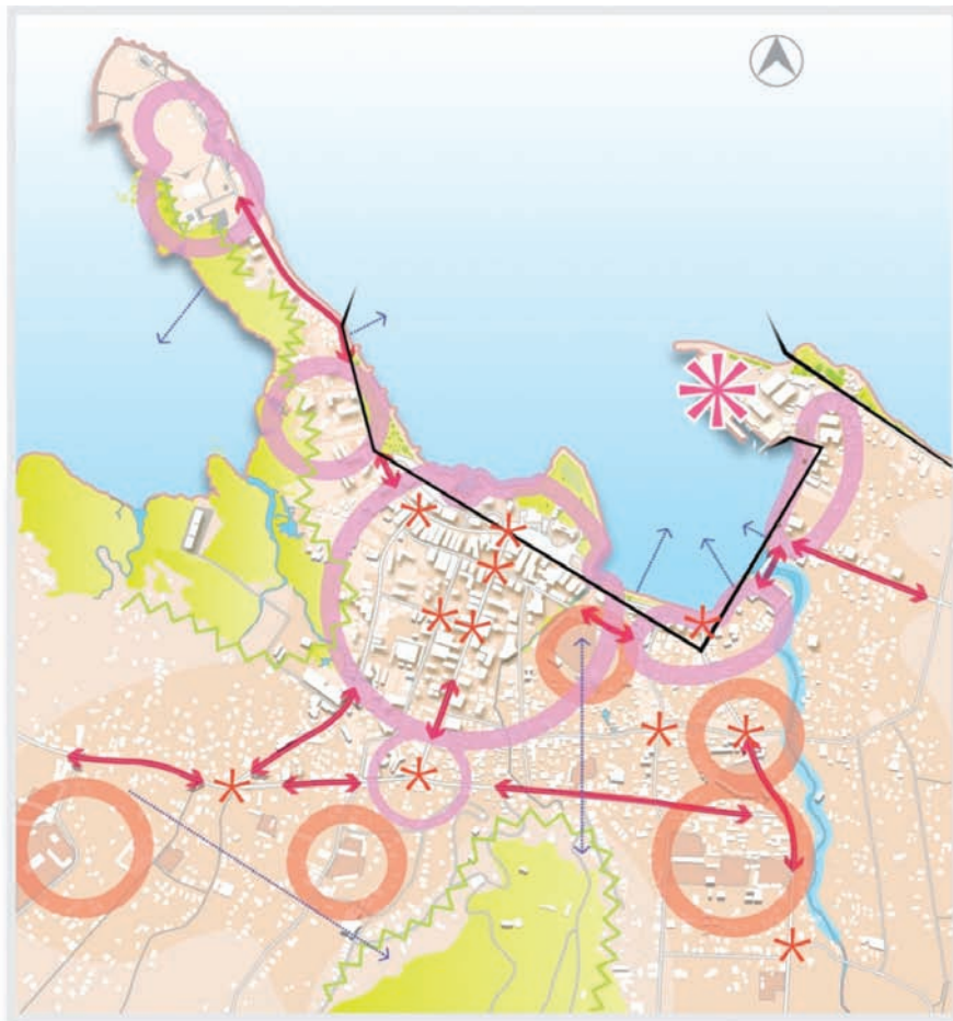
Figure 2: Spatial Analysis