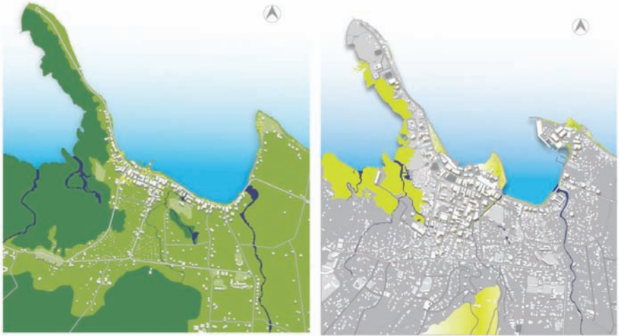
Figure 3: Urban Intensification, 1954 - 2010

The major barriers to improved urban planning that have been identified as a precursor to successfully implementing the National Urban Policy include: